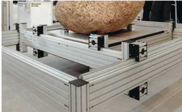
(Name of graphical metafile: Bild2.tif)

A special fastening system enables the Profiles of the Basic Elements to be used directly as Support Profiles for the Shafts. This means that neither special profiles nor machining of the shafts are required. The fasteners are, in this case, the Shaft Clamp Profiles, that locate in the profile groove of the Support Profile. The patented shaft clamping system has a two-for-the-price-of-one effect: as the Shaft is pressed into the Shaft Clamp Profile, it automatically locks the clamp profile in place in the groove of the Support Profile. In this manner, a power-lock joint is created which is further enhanced by an undercut in the Shaft Clamp Profile.