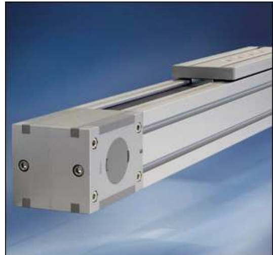
item KLE: Greater reliability, since no moving external parts

The cutting-edge design of the Linear Units is just as impressive as their performance data. The units benefit from generously proportioned Roller Guides, completely encased in the KLE. With the exception of the linear slide, it is impossible to come into contact with any moving parts. This unit does much more than simply pay lip service to safety.